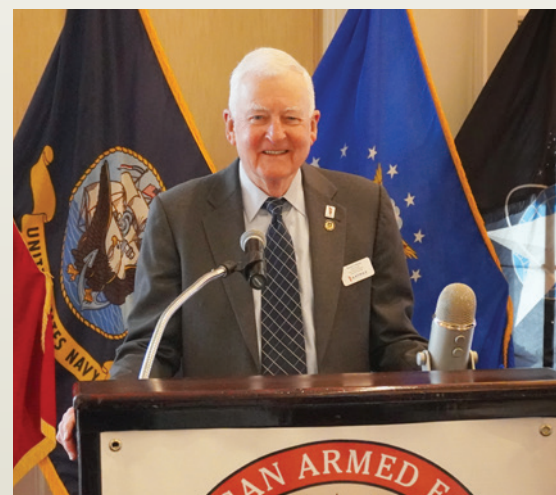
GEN Dennis J. Reimer (USA, Ret.)